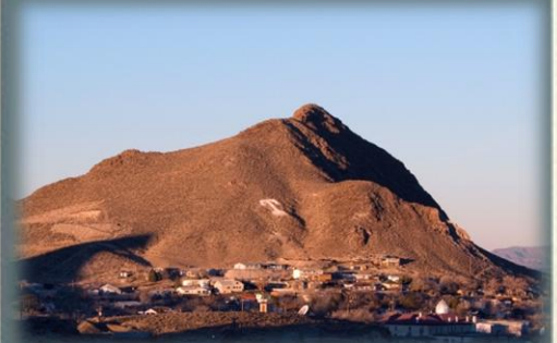
Photo: Brouher Mountain