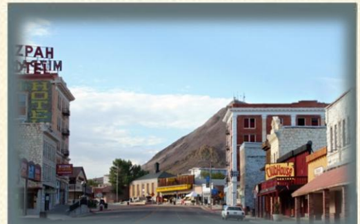
Photo: Main Street in Tonopah, NV